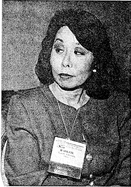
Advisory Committee member

14 Require medical schools to include nutrition training.